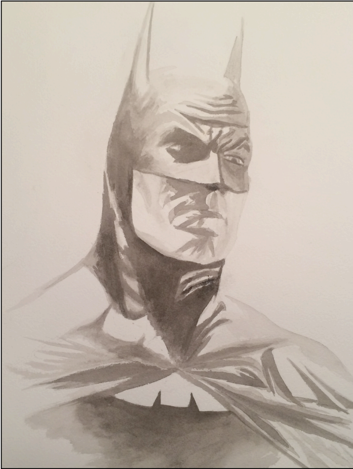
Based on art by Alex Ross

I often find myself learning a new art form in order to reproduce artwork I love and, frankly, want on my walls. Here are two reproduction pieces I did of two great detectives, and a photo reproduction I did as a gift.