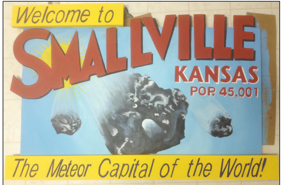
Clockwise: Smallville sign reproduction, "Contaminated Cow!" based on art by Bruce Timm, "Sweeney Todd", Sherlock skull reproduction (created on two levels of glass), reproduction based on art by Roberto Fabelo.